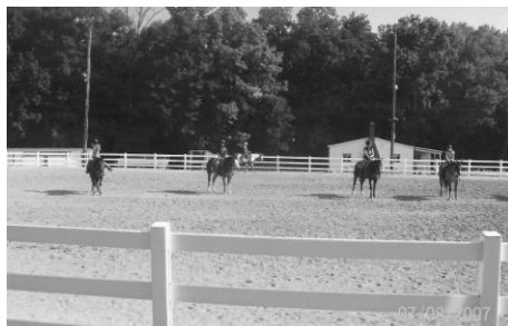
Afternoon session in progress